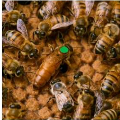
2024 ITALIAN CARNIOLAN QUEEN