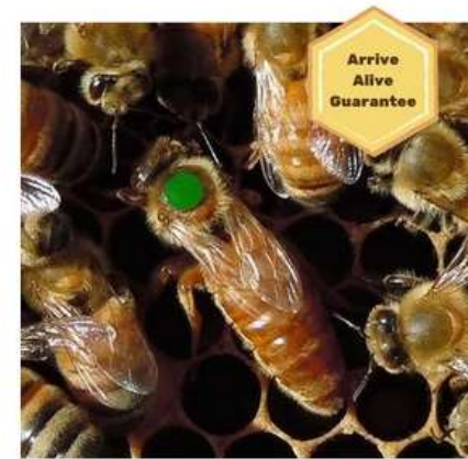
2024 AFB INOCULATED MARKED ITALIAN QUEEN (SHIPPING INCLUDED)