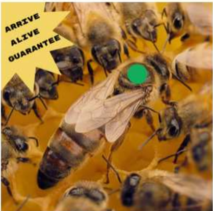
2024 RUSSIAN/CARNIOLAN MARKED QUEEN SHIPPING INCLUDED

Thank you to THE BEE SUPPLY for donating toward clothing & equipment for MBA Youth Scholarships!