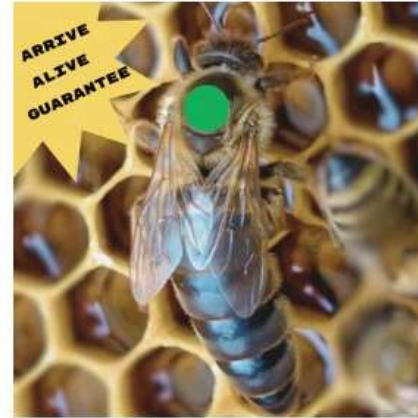
2024 CARNIOLAN MARKED QUEEN SHIPPING