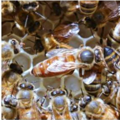
2024 GOLDEN CORDOVAN MARKED QUEEN