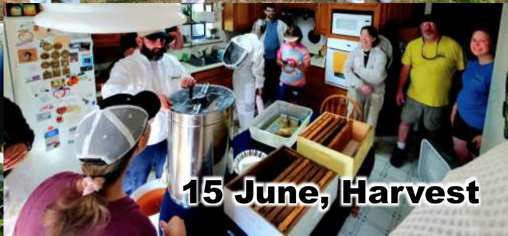
15 June, Harvest