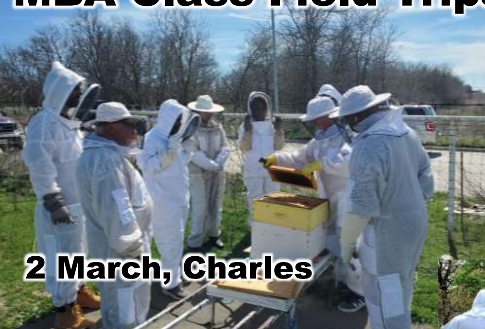
2 March, Charles