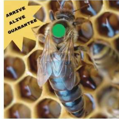
2024 CARNIOLAN MARKED QUEEN SHIPPING