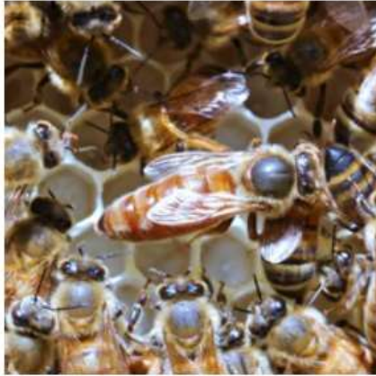
2024 GOLDEN CORDOVAN MARKED QUEEN