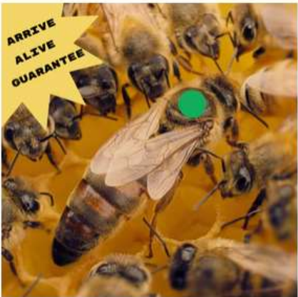
2024 RUSSIAN/CARNIOLAN MARKED QUEEN SHIPPING INCLUDED

Thank you to THE BEE SUPPLY for donating toward clothing & equipment for MBA Youth Scholarships!