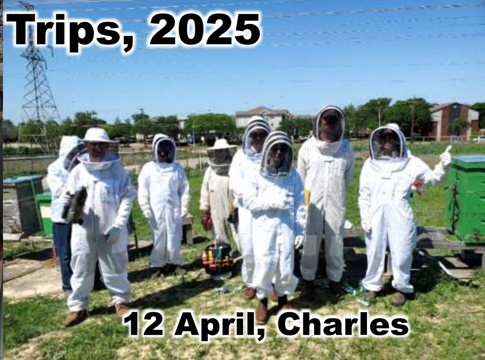
12 April, Charles